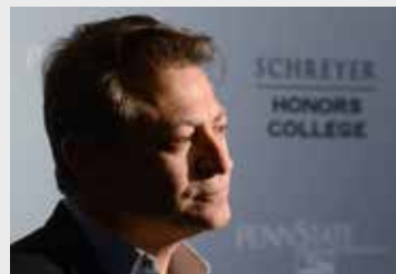
📍 Dr. Peter Diamandis, founder and chairman of the XPRIZE Foundation